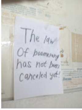
07A Threatening Note.jpg 295K